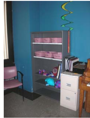
8-East UMASS Worcester

Comfortable couch or recliner Large locked cabinet for supplies. Bookcase or shelves for bins and equipment Capability for Music (Stereo, CD players & headphones) Whiteboard for group use, messages, or sign out for supplies TV with VCR & DVD Player Fan for airflow and white noise Painted walls and ceiling Art, posters, and scenic wall murals