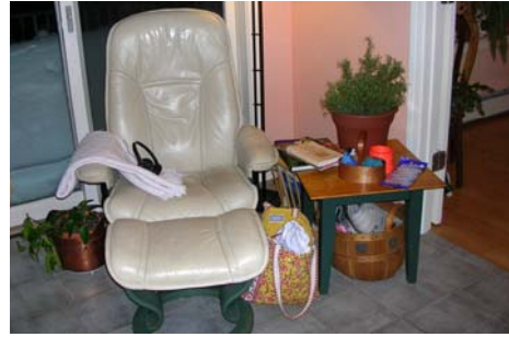
“Safe Space” in the home